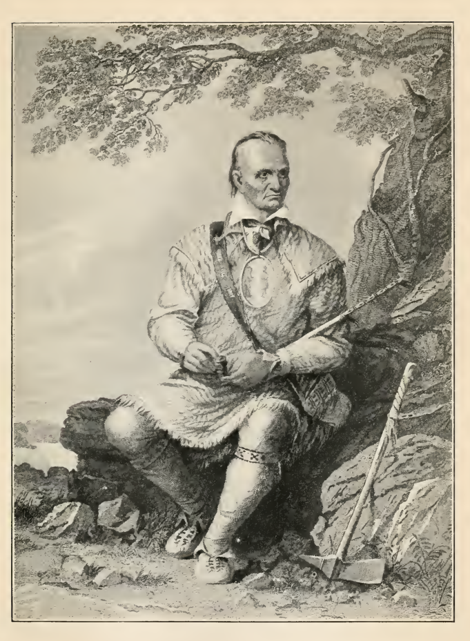
RED JACKET, OR SA-GO-YE-WAT-HA.