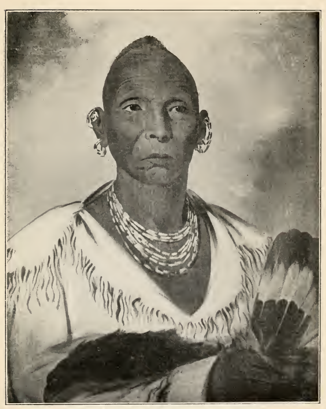
BLACK HAWK.