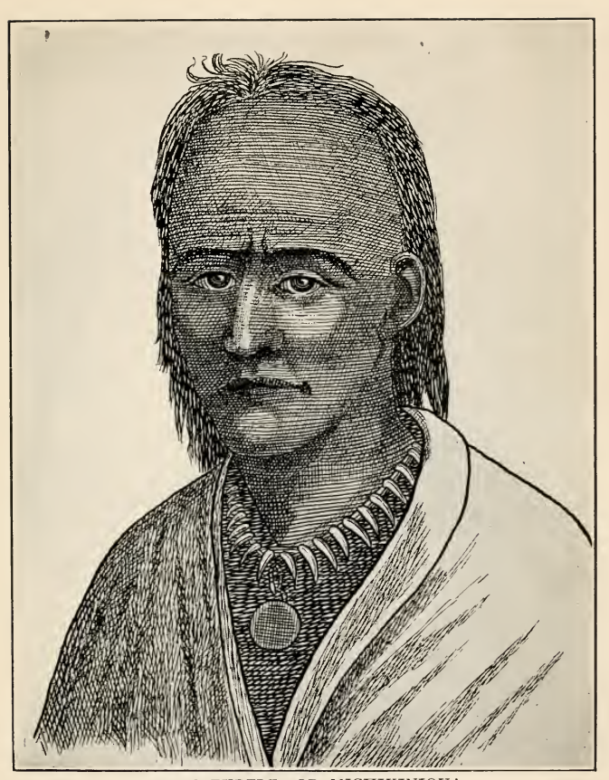
LITTLE TURTLE, OR MICHIKINIQUA.