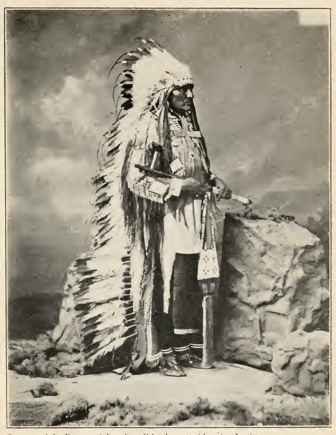
AMERICAN HORSE.