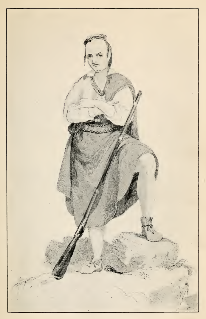
KING PHILIP, OR METACOMET.