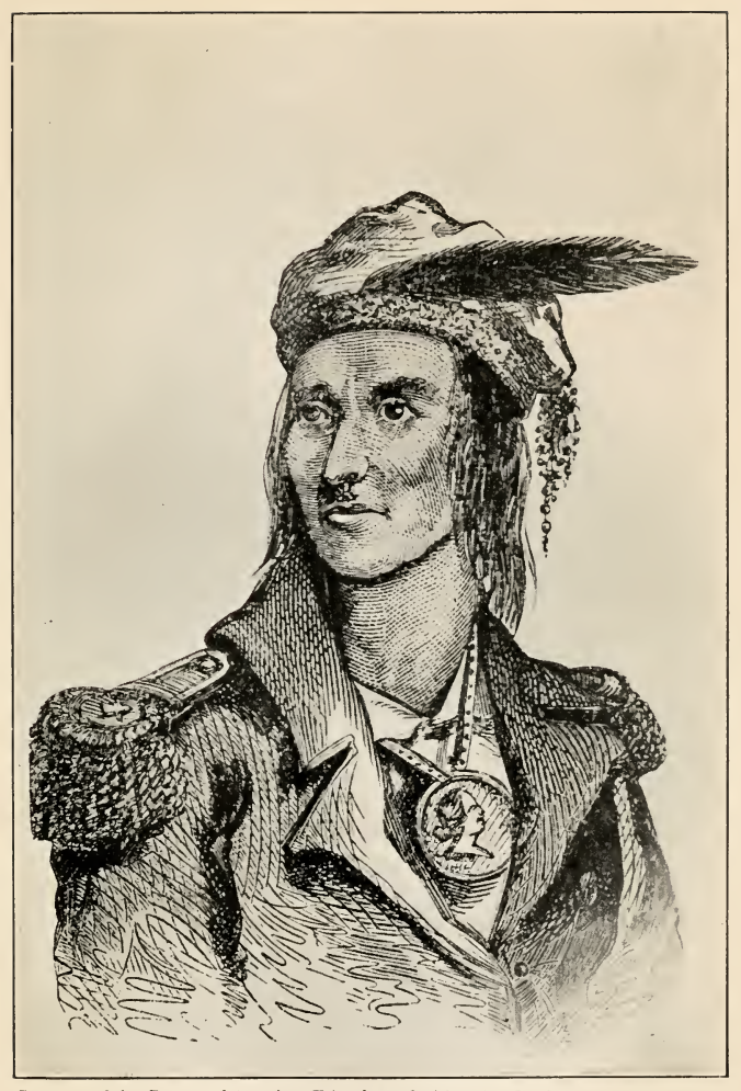
{\bf TECUMSEH.}