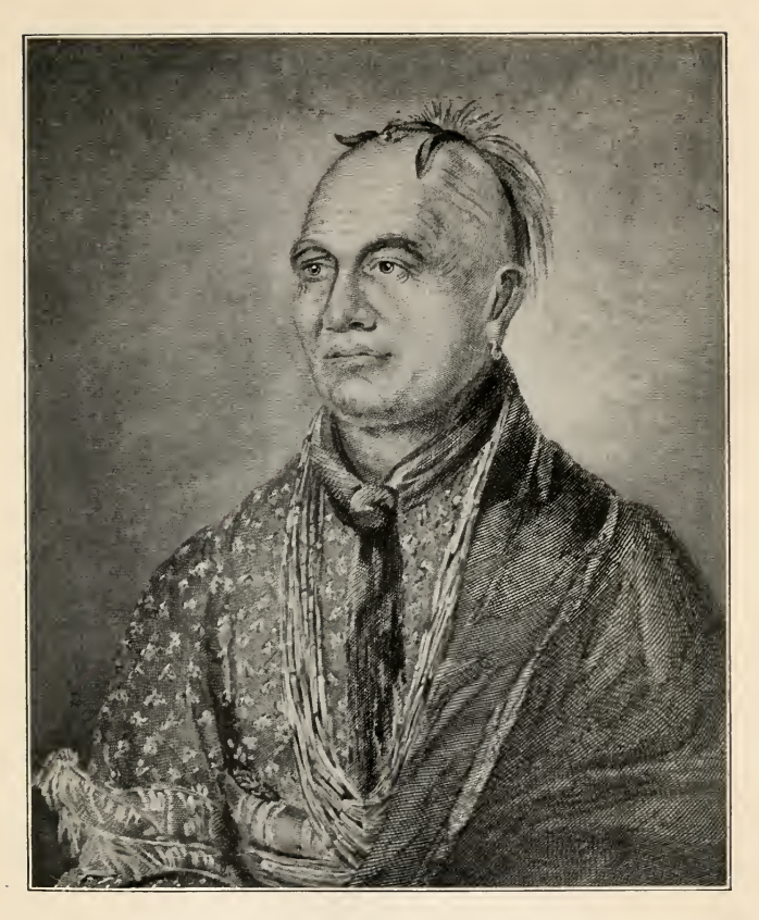
JOSEPH BRANT, OR THAY-EN-DA-NEGEA