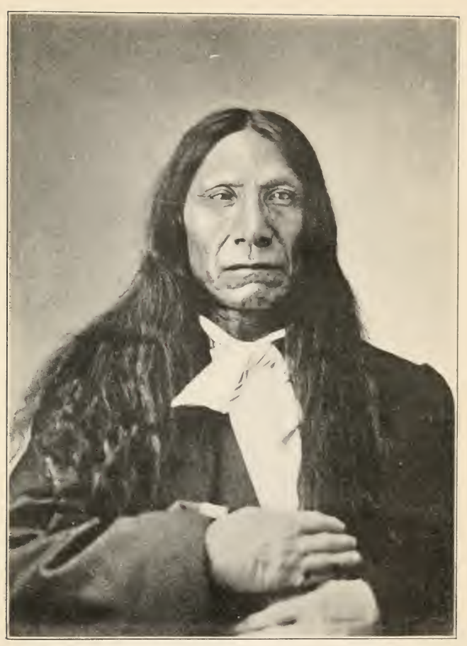
{\tt RED\_CLOUD}.